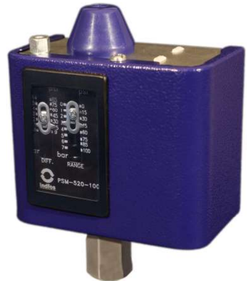
Pressure switch mechanical, model PSM-520